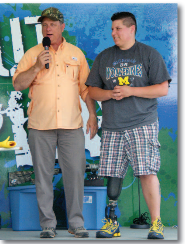
Award winners claim their prize in Tips Up for Troops, an event co-sponsored by the Veterans Task Force.