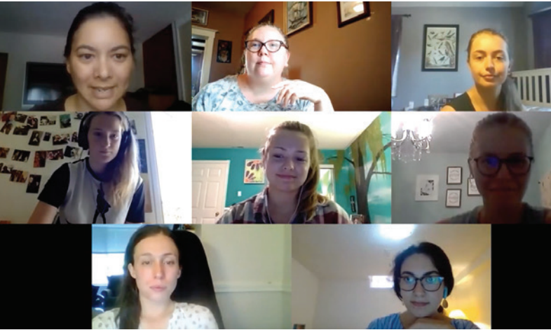
Youth Ambassador of Reconciliation Program participants met via Zoom to discuss reconciliation.

Throughout the past year, as our country has grappled with the effects of colonialism that surfaced in the news, the Canadian Indigenous Ministry Committee (CIMC) continued to offer resources and support to churches on journeys of reconciliation.