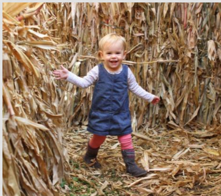
Photo courtesy of Dan Nicholas Photos by Dan can be found at : www.dannicholasphotography.com