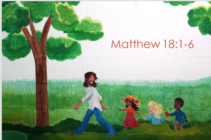
Taken at First Reformed Church, Peilo, IA