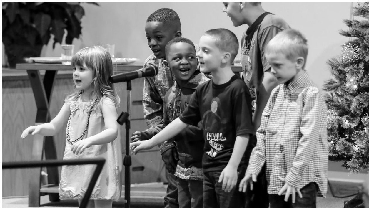
Faith Formation is crucial for CRC members of all ages.