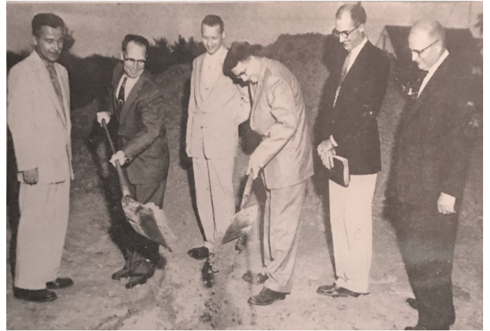
Ground Breaking Ceremony 1957

CotS remains the only CRC in the South Bend area, and draws people of various faith backgrounds. Presbyterians, Baptists, Lutherans, Catholics, and evangelicals of all types have found a home at CotS. This gives a unique flavor to our church community, different from many traditional CRCs. CotS has gained the reputation of being an oasis for those disillusioned by the church but still wanting to hang on to faith. It is a community where we have learned to be comfortable with differences, questions, and doubts, and not having everything figured out.