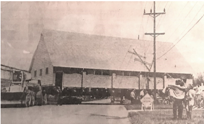
Crowds watch as the church is moved 1970

South Bend CRC began in 1956 in the basement of the church parsonage. Within two years, the church building was constructed, and twelve years later that building was slowly and painstakingly moved across town, to a newly purchased, larger parcel of land. An education wing was added at that time. In 2003 a new sanctuary was added on, as well as another kitchen, an atrium, and two nurseries. In 2014 SBCRC changed its name to Church of the Savior.