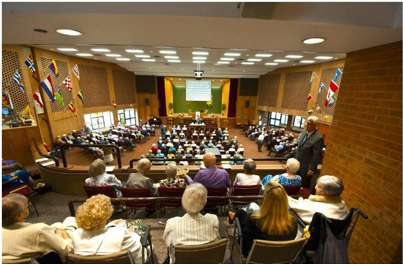
Heritage Fellowship CRC worship service in Heritage Hall