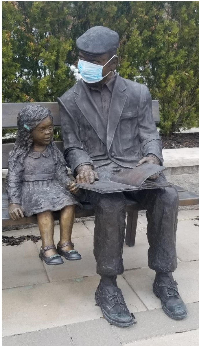
Opa Reading statue in the courtyard at HCH.