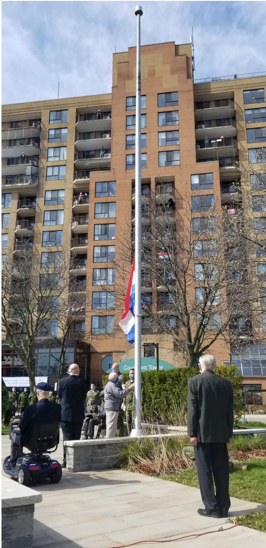
May 5, 2020 – Dutch Liberation Day ceremony with WWII Dutch veterans and current Canadian military service men and women.