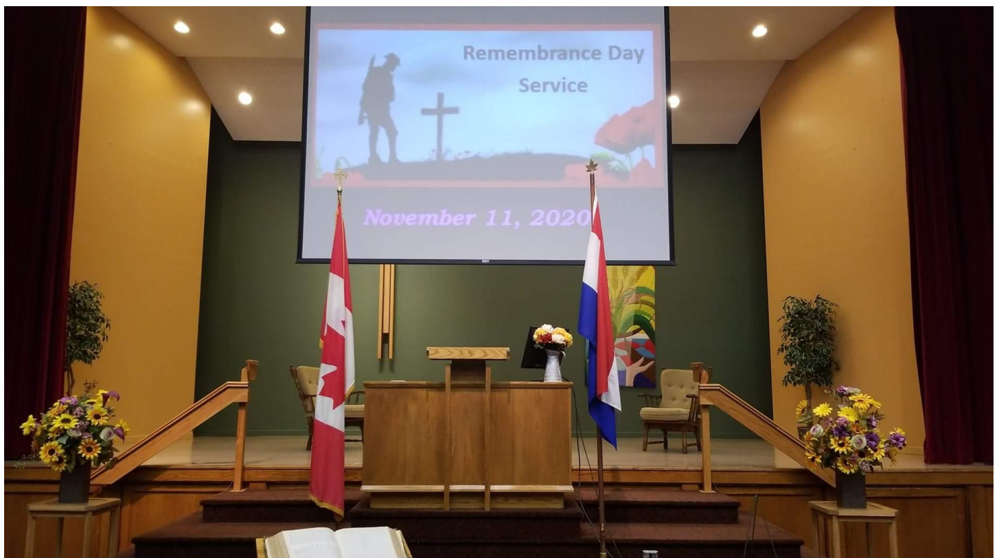
Remembrance Day Service, Heritage Hall