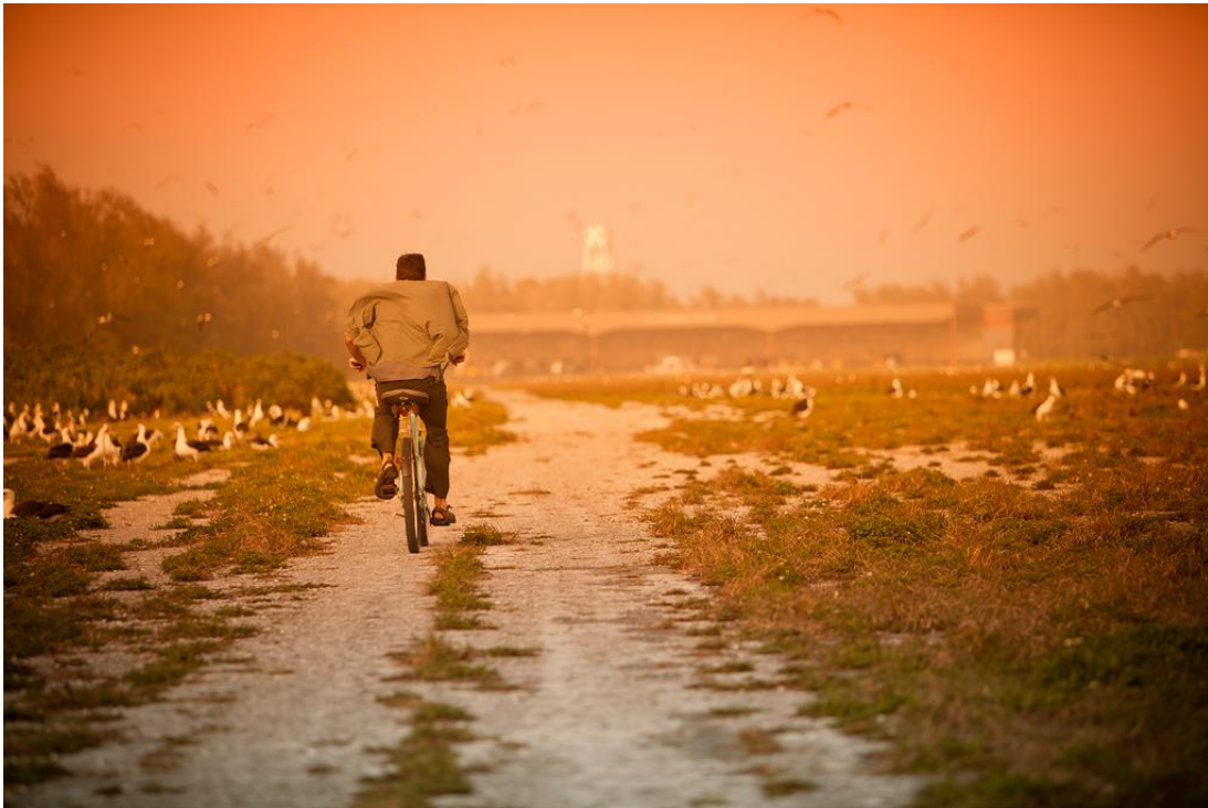
Figure 1 Flickr user Kris Krug