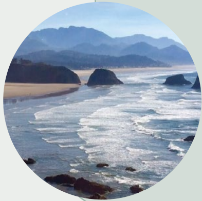
The beach 1.5 hours