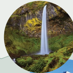
Columbia River Gorge 1 hour