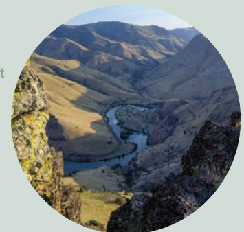
High Desert 2.5 hours