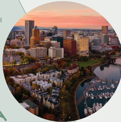
Portland 20 min