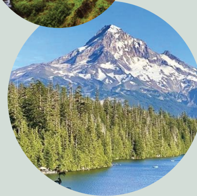
The mountains 1.5 hours