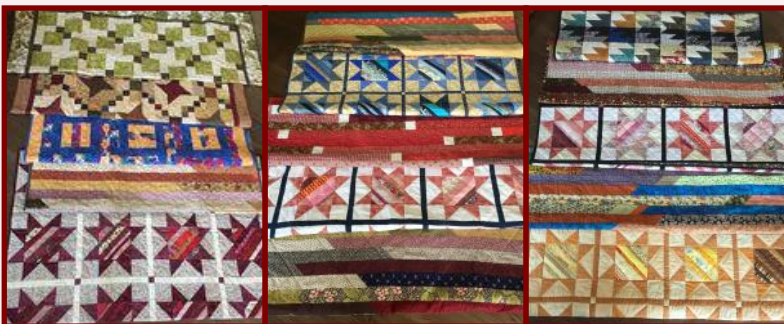
Quilts made by the Community Comfort Quilters

Marriage is an institution created by God. It is a covenant relationship established by mutual vows between a man and a woman (biological gender at birth) united by God. Permanent unity in marriage is possible in Christ and is demanded of Christ's disciples who are married. The Church has a guideline document on marriage and the marriage ceremony.