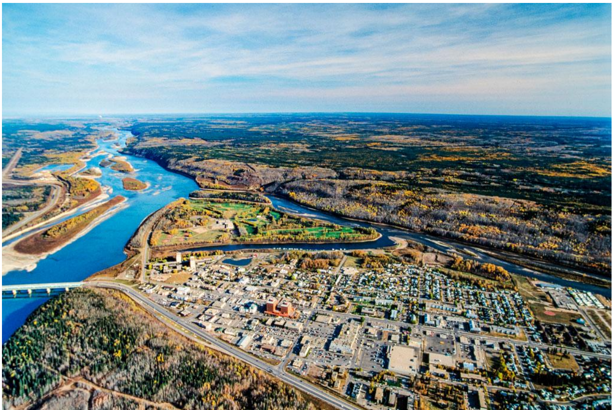
Fort McMurray during the Fall (Stock Photo ID: 1334990747)