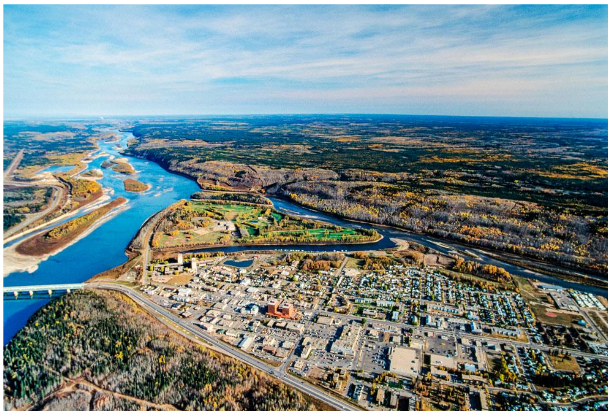
Fort McMurray during the Fall (Stock Photo ID: 1334990747)